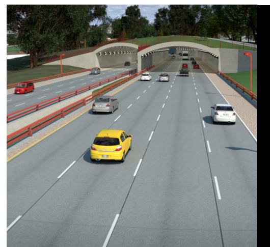
Rendering of tunnel entrance.

For more information, visit: www.autodesk.com/gov, www.autodesk.com/civil3d, www.autodesk.com/3dsmax, www.autodesk.com/navisworks.