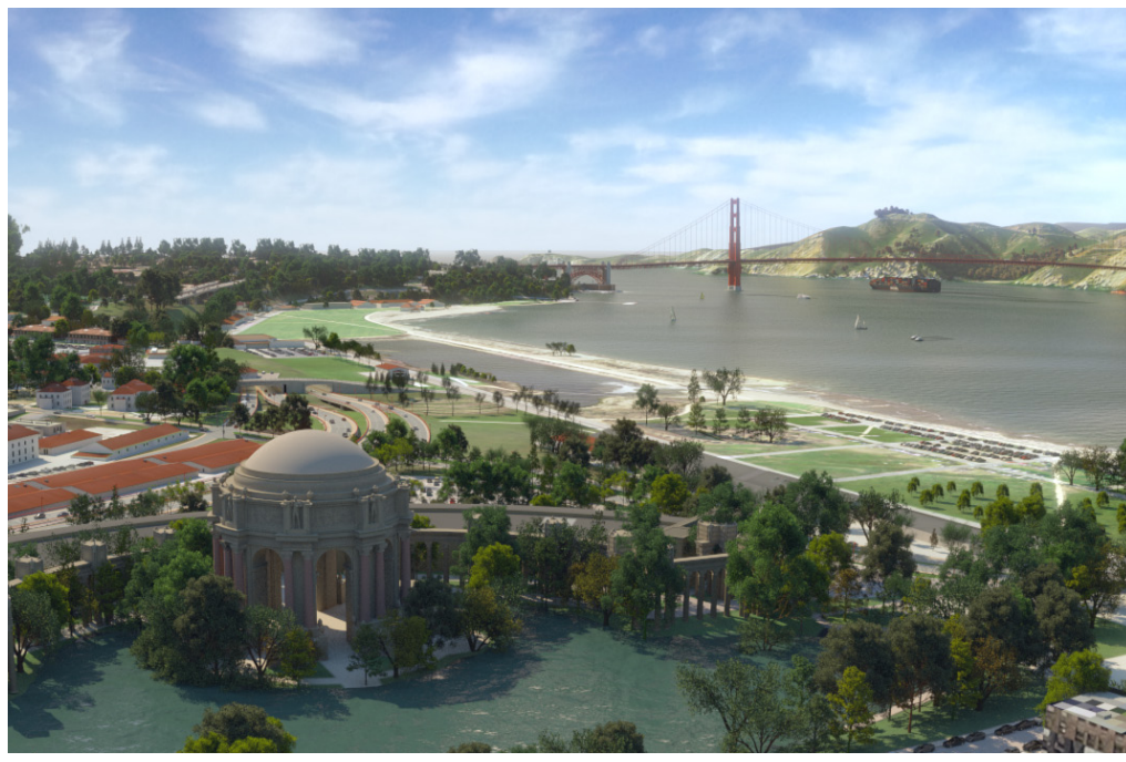
Rendering of San Francisco's new Presidio Parkway.

Parsons Brinckerhoff uses Autodesk BIM solutions for virtual road design and construction in San Francisco.