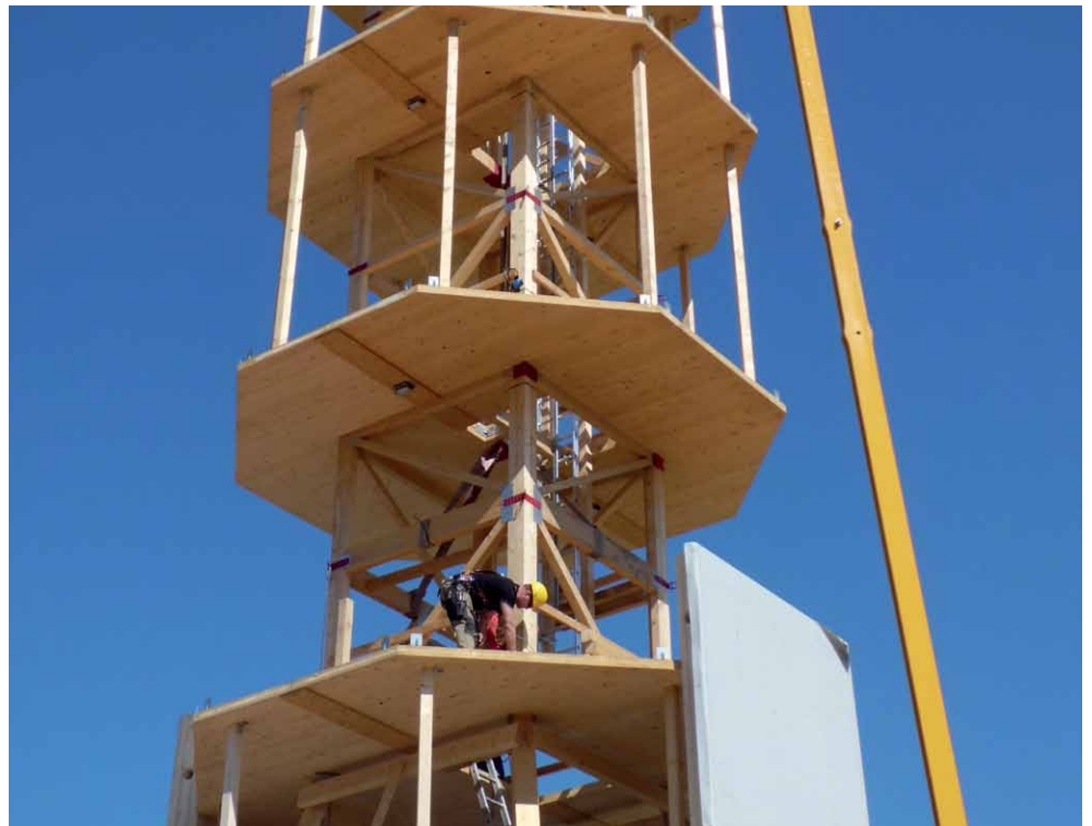
Pilot tower 1: Tower scaffold.

TimberTower GmbH designs and builds wind turbine towers made from laminated wood and is revolutionising the industry in the process. The company is supported by the Autodesk Clean Tech Partner Programme.