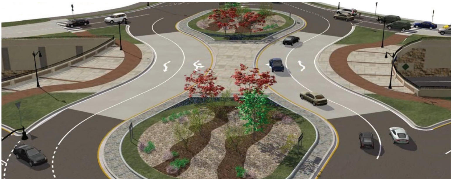
The redesigned Keystone Parkway in Carmel, Indiana, features the state’s first teardrop roundabout interchanges.