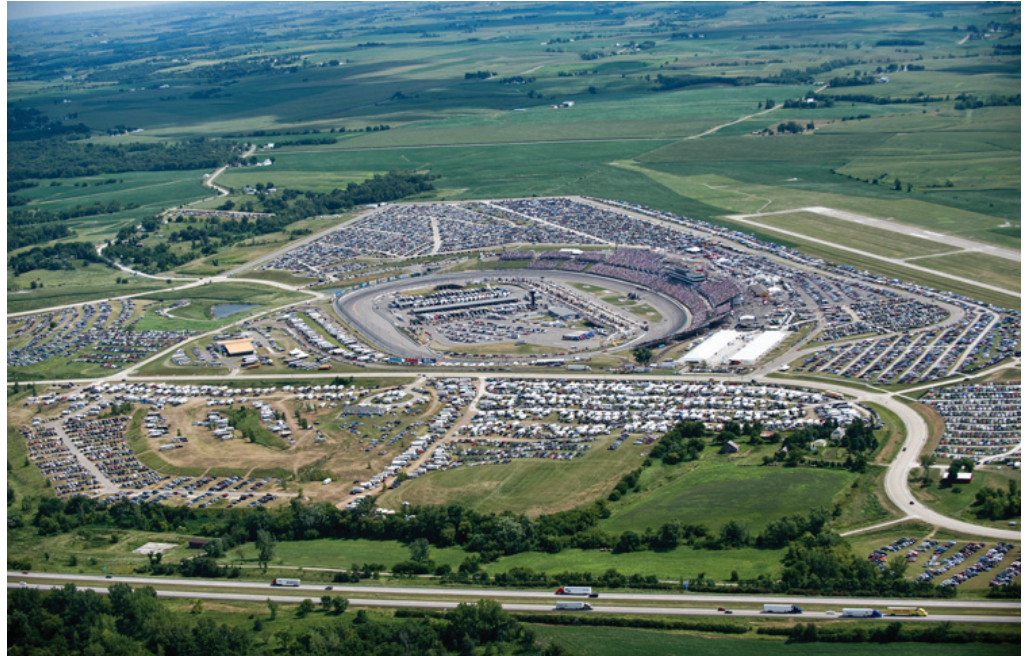
Completed $70-million Iowa Speedway.

American Structurepoint uses Autodesk® BIM for Infrastructure solutions to help increase efficiency on infrastructure projects.