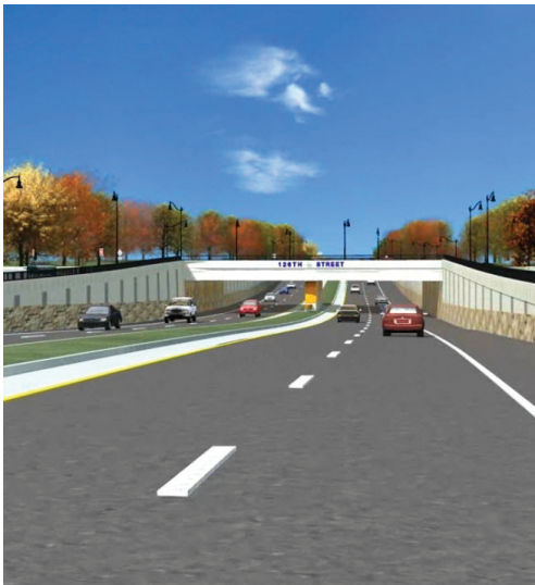
An animation of a traffic simulation to help evaluate appropriate design alternatives.

From American Structurepoint’s perspective, model-based design processes were essential for the success of the project. “The ability to visualize our design and then communicate that vision to the project stakeholders was the true value of these tools on the Keystone Parkway project,” says Canfield. “Without that vision, this project would not have become a reality.”