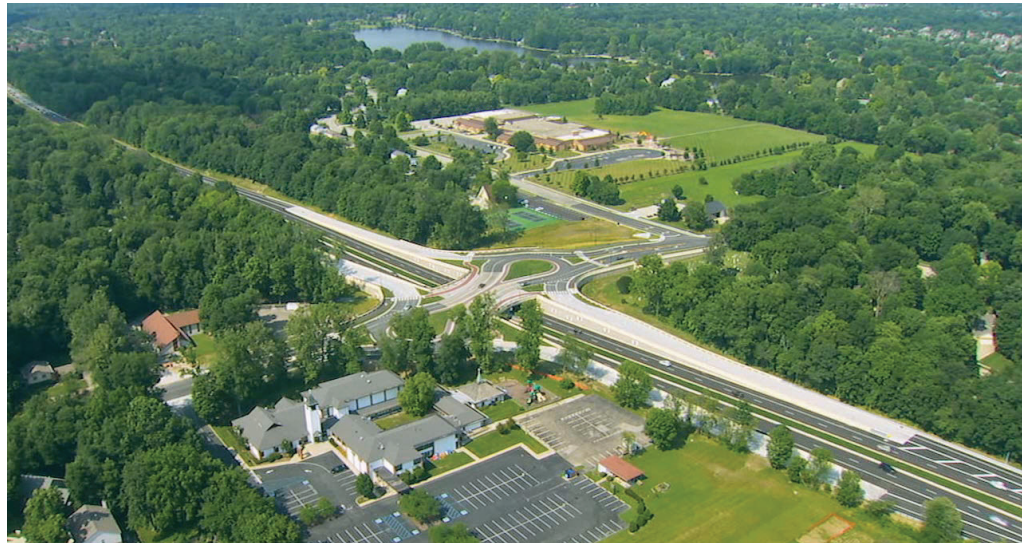
American Structurepoint designs a sustainable, low-impact infrastructure project.