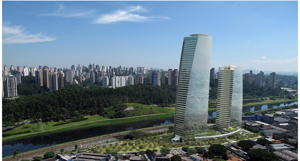
Rendering of Brookfield Towers against the São Paulo skyline.

Botti Rubin Arquitetos Associados uses Autodesk design software to increase efficiency and win new work.