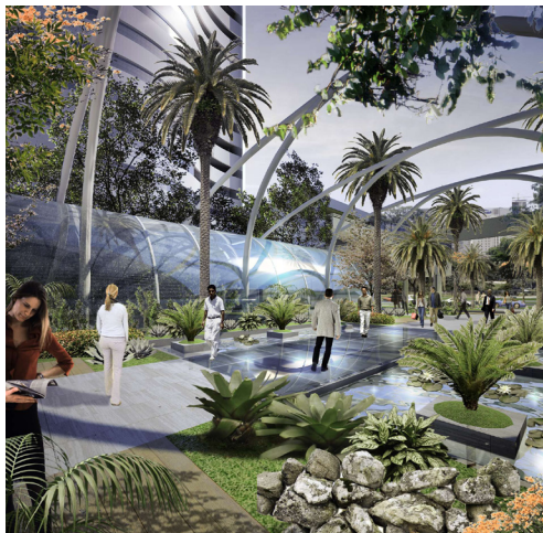
Rendering of the Brookfield Towers courtyard garden. Image by Sandro R. Machado/bra

Get more out of AutoCAD software as you move to BIM. Visit www.autodesk.com/autocad and www.autodesk.com/revit to find out how.