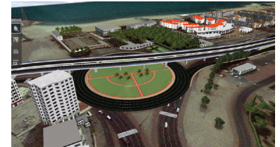
Roadway conceptual design —Provide visually rich conceptual design options for improvements to the Arabian Gulf Street (the Coast Road).