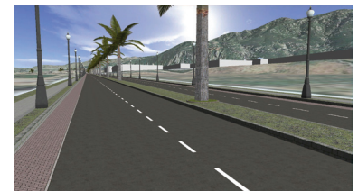
Transportation Corridor Planning —Sketch and study proposed road improvement options in the context of the existing environment.