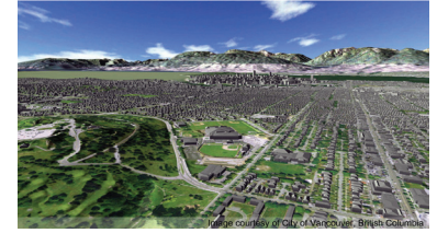
Neighborhood Scale Development —Queen Elizabeth Park View.

Finally, you can import data from Autodesk Infrastructure Modeler 2012 and 2013 software into AutoCAD Map 3D 2012 and 2013 software and AutoCAD Civil 3D 2012 or 2013 software. Also you can import data to Autodesk Revit 2012 or 2013 software via FBX. This integrated approach reduces the need for redundant and costly rework, saving you time and money.