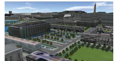
Urban Planning —Study urban planning design concepts.