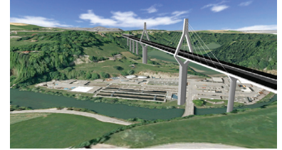
Design concept alternatives for bridge project.

Whether you are trying to win more work or gain support for project funding, Autodesk Infrastructure Modeler can help you to more effectively communicate design intent to stakeholders for greater understanding of infrastructure proposals and faster decision making.