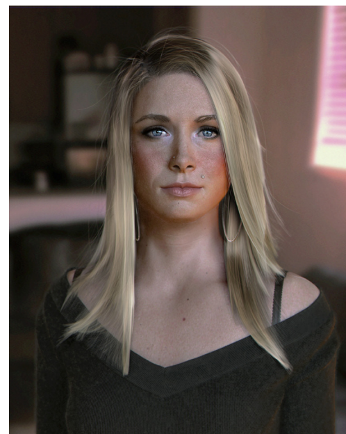
Maya and Mudbox image courtesy of Dan Roarty

Adapt 3ds Max to your personal way of working by selecting from a choice of default or custom workspaces. Each workspace can have individual settings for menus, toolbars, ribbon, and viewport tab presets; in addition, selecting a new workspace can automatically execute a MAXScript. This enables you to more easily configure the workspace to suit your preferences or to fit the task at hand.