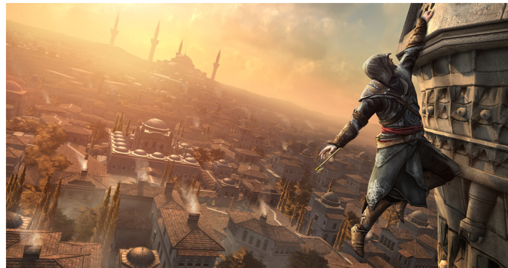
3ds Max and MotionBuilder Assassin's Creed® Revelations

Autodesk SketchBook Designer 2013 software enables you to explore and present new ideas for characters, props, and environments using an intuitive hybrid paint and vector toolset. SketchBook Designer features sketching, painting, and image compositing workflows; easy color manipulation; mixed media workflows; and an industry-unique transformation tool. The dynamic, scalable user interface is optimized for both pen and mouse interaction, and is designed to offer maximum creative freedom.