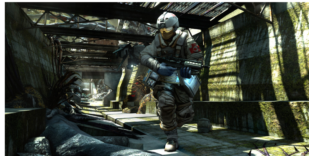
Maya, MotionBuilder and Mudbox