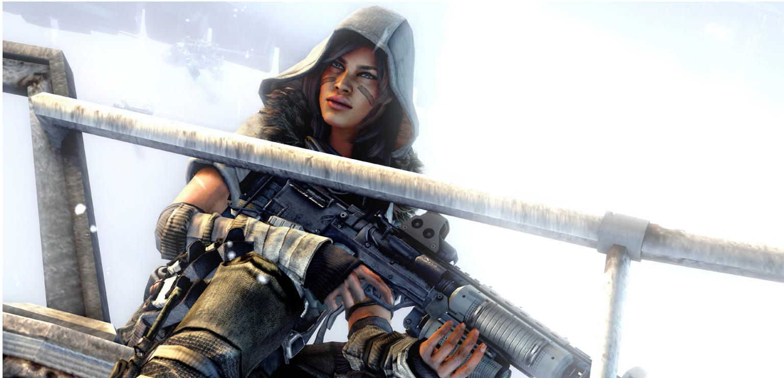
Maya, MotionBuilder and Mudbox image courtesy of Guerrilla B.V.