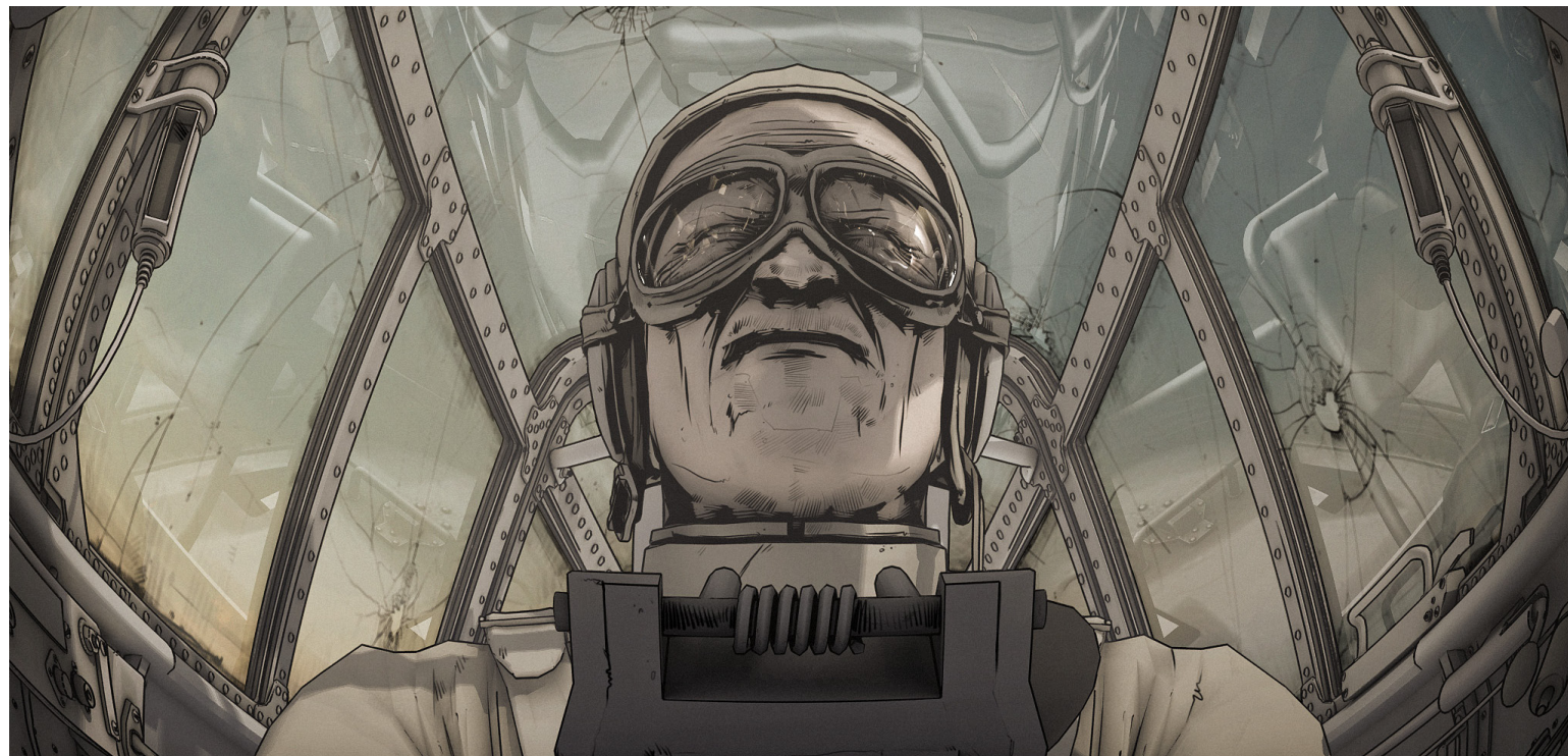
3ds Max image