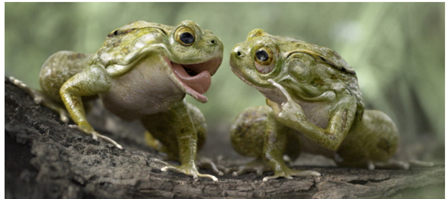
Maya image