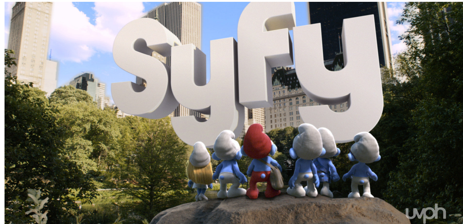
Maya and Softimage image courtesy of UVPFACTORY