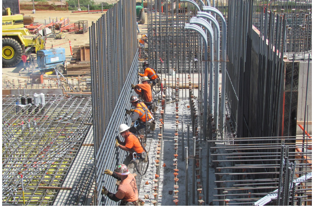
Rebar and conduit installation.

With help from BIM, Haskell Architects and Engineers P.A. greatly improves coordination on a complex medical facility design.