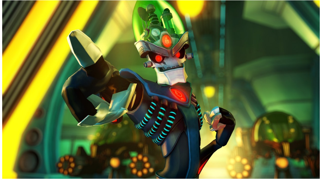
Ratchet and Clank Future: A Crack in Time , Sony Computer Entertainment/ Insomniac Games.