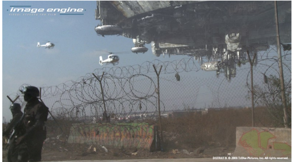
District 9 .

More easily segment, reuse, and exchange data with or without file referencing. A new option to create assets with transforms (DAG assets) helps streamline the most common workflows with assets. Moreover, data can be exported and imported as offline files to flexibly partition scenes, while reference edits can be imported, exported, and removed without unloading.