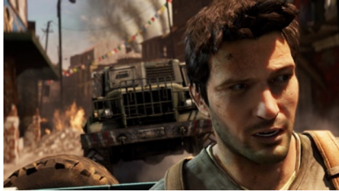
Uncharted 2: Among Thieves™ . Image courtesy of Naughty Dog, Inc.