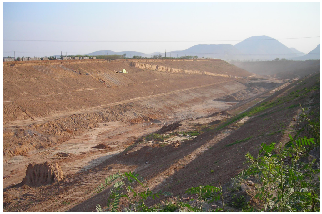
Photo of the South-to-North Diversion project (central route).

Autodesk Civil 3D helps CISPDR increase efficiency on world's largest water conservancy project.