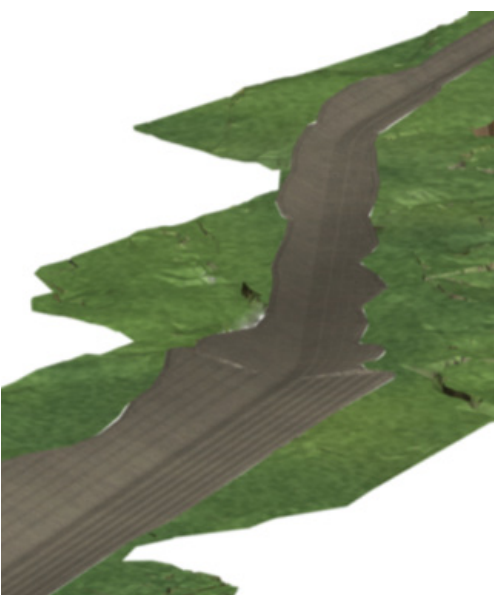
Rendering of the South-to-North Diversion project.

For more information, visit www.autodesk.com/ civil3d.