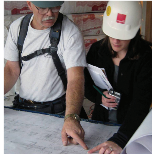
Architect/Subcontractor Collaboration On-Site.