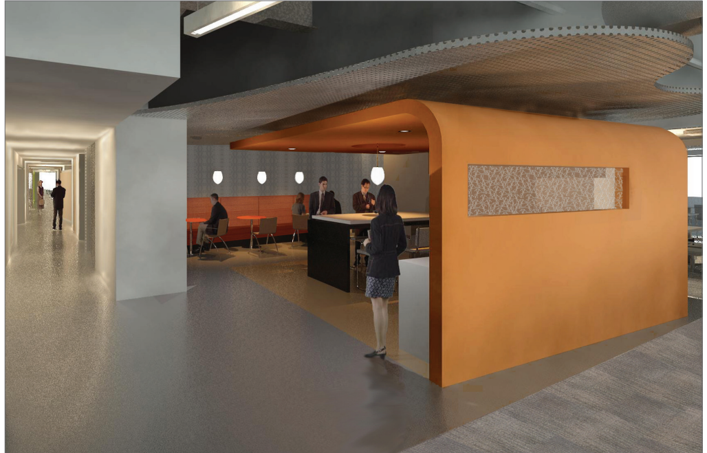
Autodesk Waltham AEC Headquarters, Break Room.

A New England commercial interiors project breaks new ground with integrated project delivery.