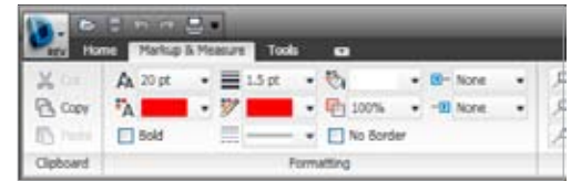
New, task-based ribbon interface.

Autodesk Design Review improves team communication by putting design information into the hands of the people who need it. Design Review offers you an intuitive solution for reviewing designs and responding to comments, and helps ensure that revisions are timely and comprehensive. And Design Review is tightly integrated with your other Autodesk products, such as AutoCAD®, Revit®, Autodesk® Inventor®, AutoCAD® Civil 3D®, and AutoCAD® Map 3D software.