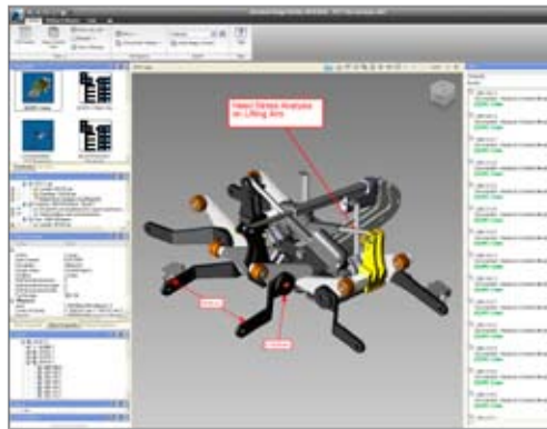
Markups made on models always remain available for reference.