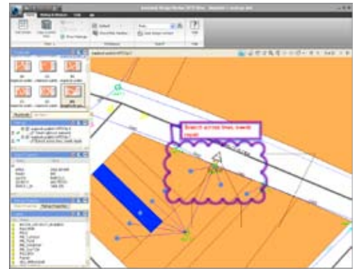
Markups made using Design Review are recorded in the Revit, Inventor, Civil 3D, or AutoCAD Markup Set Manager for easy navigation and quick revisions.