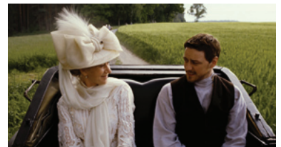
The Last Station.