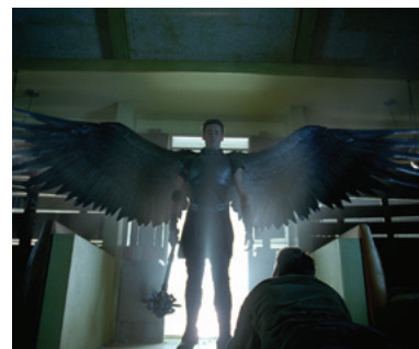
SPIN VFX | Screen Gems | © 2010 Sony Pictures Digital Inc. All Rights Reserved | Bold Films.