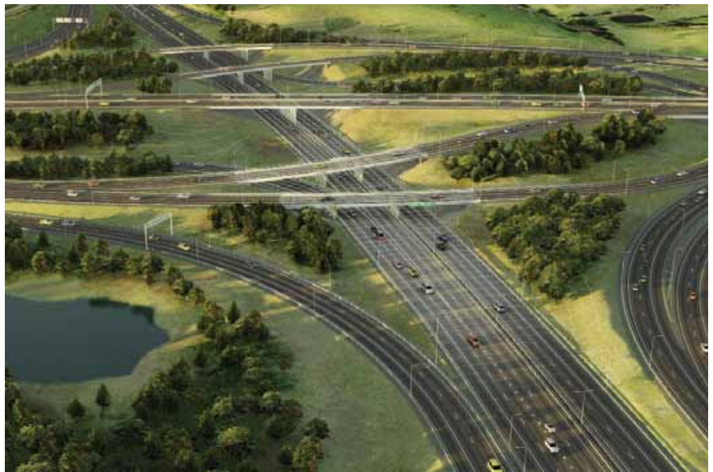
Aerial view of a highway with wireframe overlay. Designed in AutoCAD® Civil 3D® software. Rendered in Autodesk® 3ds Max® software.

AutoCAD® —foundational design, documentation, and communication