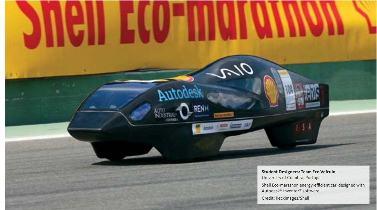
Student Designers: Team Eco Veículo University of Coimbra, Portugal Shell Eco-marathon energy-efficient car, designed with Autodesk® Inventor® software.

Autodesk provides educators with technology solutions that support learning, engage students in complex concepts, inspire creativity, and help prepare students for successful careers.