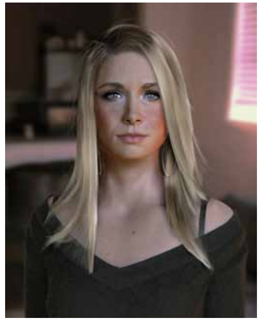
Maya and Mudbox image courtesy of Dan Roarty

Adapt 3ds Max to your personal way of working by selecting from a choice of default or custom workspaces. Each workspace can have individual settings for menus, toolbars, ribbon, and viewport tab presets; in addition, selecting a new workspace can automatically execute a MAXScript. This enables you to more easily configure the workspace to suit your preferences or to fit the task at hand.