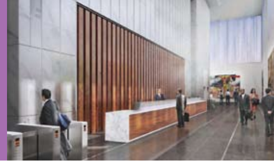
Lobby Rendering Architect: Skidmore, Owings & Merrill LLP ©Skidmore, Owings & Merrill LLP / SWIM