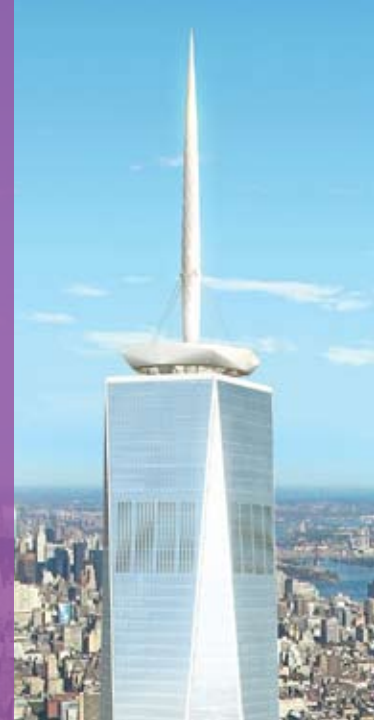
Architect: Skidmore, Owings & Merrill LLP

Autodesk® Revit® Building Autodesk® Revit® Structure Autodesk® Revit® Systems AutoCAD® Autodesk® 3ds Max® Autodesk® Buzzsaw® Autodesk® Constructware® Autodesk® Design Review Autodesk Consulting