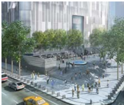
West Plaza Architect: Skidmore, Owings & Merrill LLP

JB@B used Revit Systems to model building systems content for improved coordination with all disciplines.