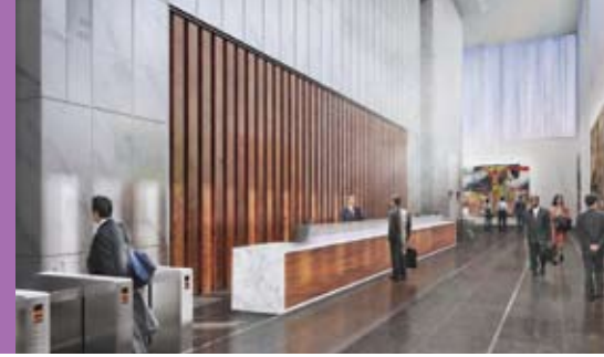
Lobby Rendering Architect: Skidmore, Owings & Merrill LLP